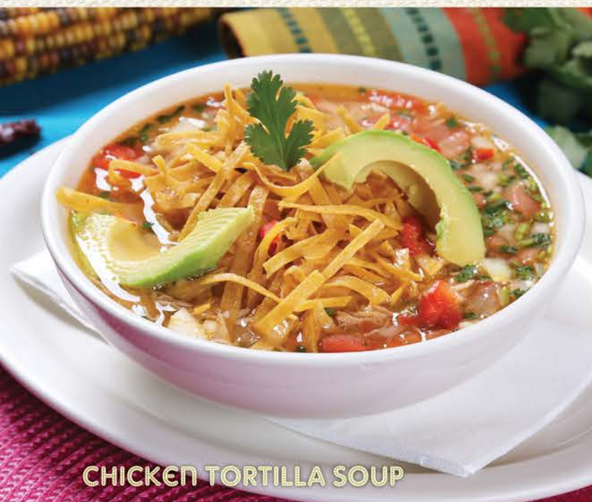
CHICKEN TORTILLA SOUP

TACOS SIDES: ONIONS, LETTUCE, JALAPEÑOS, CILANTRO, TOMATOES, PEPPERS, CORN, MUSHROOMS OR SHREDDED CHEESE. EXTRA SIDE .65¢ EACH